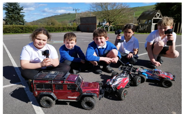
Radio Controlled Car Club started last week.

23rd May: Music Workshop followed by performance to parents (details to follow)