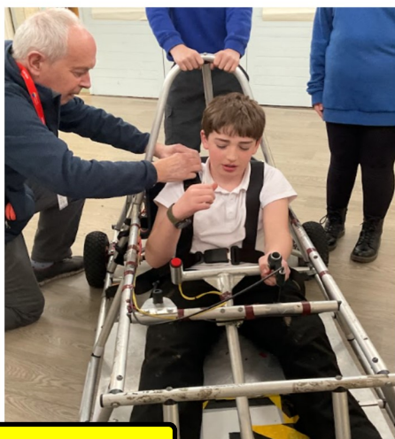
Goblin Car Club